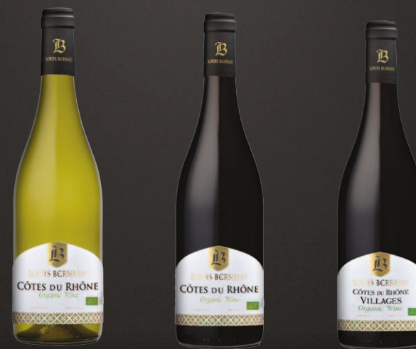
Côtes du Rhône white & red