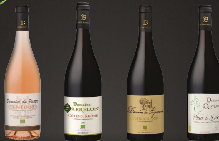
Domaine du Pastre Ventoux